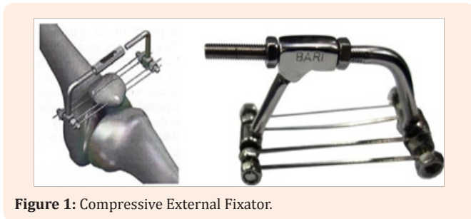
Figure 1: Compressive External Fixator.

The wires are passed through the related holes in the clamp assembly. The clamp assemblies are connected to one another (Figure 1).